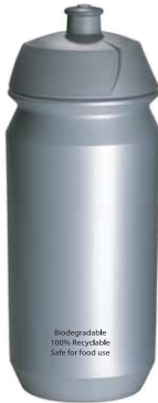
WB 002 Silver - 500CC