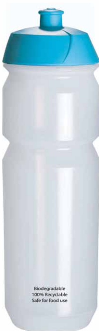
WB 003 Transparent / Aqua Lid 750CC