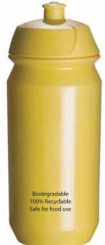
WB 002 Yellow - 500CC