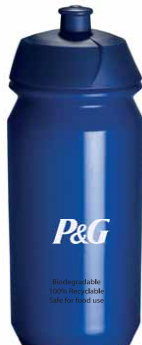
WB 002 Dark Blue - 500CC