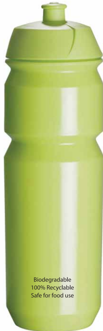
WB 003 Green - 750CC