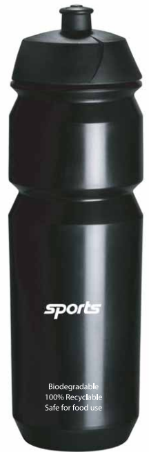
WB 003 Black - 750CC

Product Size: 7.3 x 20.5 X 7.3 cms ( 500 CC ) Product Size: 7.5 x 25 X 7.5 cms ( 750CC )