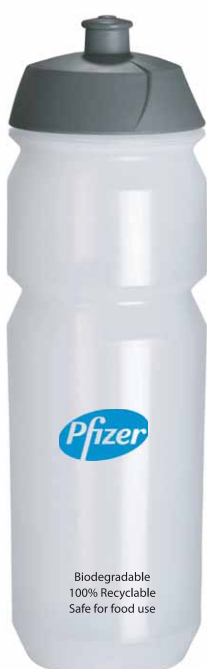
WB 003 Transparent / Grey Lid 750CC