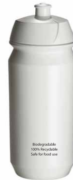
WB 002 Cream - 500CC