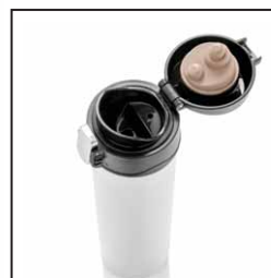
Click open mechanism