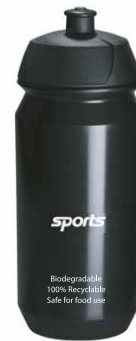
WB 002 Black - 500CC