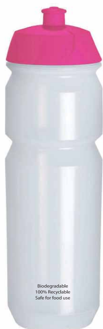
WB 003 Transparent / Pink Lid 750CC