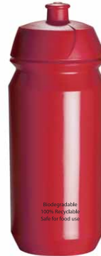
WB 002 Red - 500CC