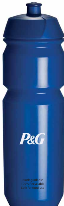
WB 003 Dark Blue - 700CC