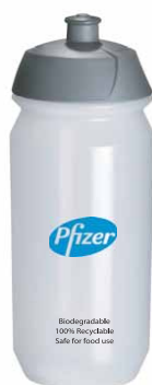
WB 002 Transparent / Grey Lid 500CC