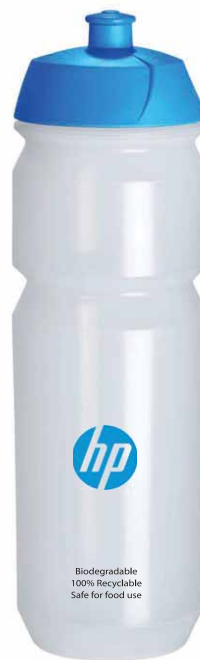
WB 003 Transparent / Blue Lid 750CC