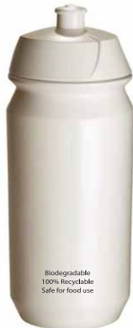
WB 002 Pearl - 500CC