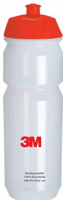
WB 003 Transparent / Red Lid 750CC