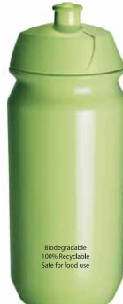
WB 002 Green - 500CC