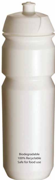
WB 003 Pearl - 750CC