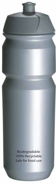
WB 003 Silver - 750CC