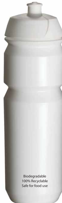
WB 003 Cream - 750CC