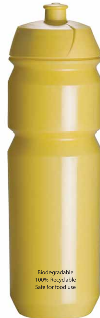
WB 003 Yellow - 750CC